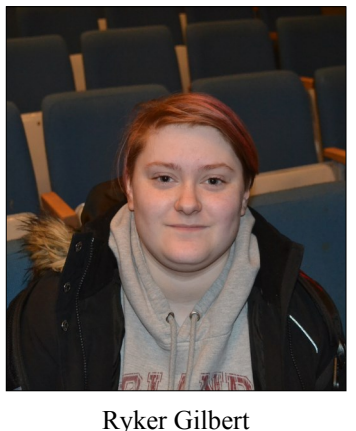
"Pitiful Children" from Be More Chill "I originally had a song that wasn't working, but then I

"It's a song that I've always loved and I thought I could put my own unique spin on it."